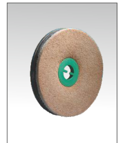
Pad holder available as option