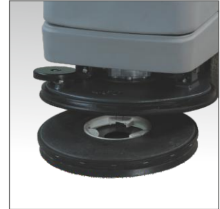
Brushes can be changed quickly without the need for any tools at the push of a button.