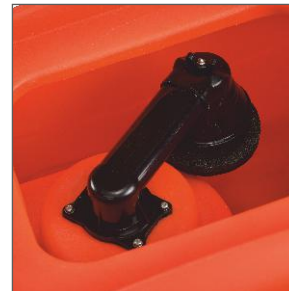
Easy tank cleaning, thanks to the large tank opening. Tank can be emptied quickly and easily via the large outlet hose. Overflow protection for the dirty water tank.