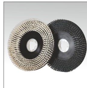
Variety of brushes to suit different applications.