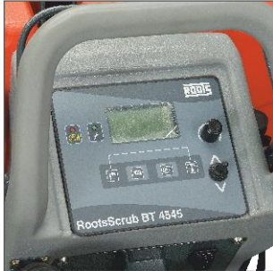
Ergonomic handle for operators of any height. Excellent view of the area to be cleaned. Soft touch buttons for selection of operation. LCD panel with display of hour meter, battery level.