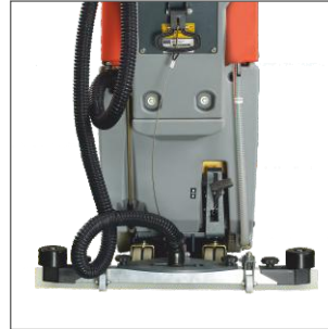
Professional self levelling Squeegee Ensuring Excellent performance